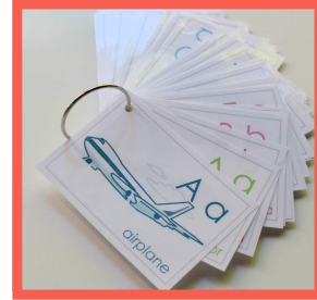
Flashcard Ring Example

The flashcards are the cards with the picture and word on the same side of the card. These flashcards are meant to help the student learn the English word for each picture. These cards can be used by putting them on a metal ring and having the student flip through the cards as they practice saying the word that goes with each picture.